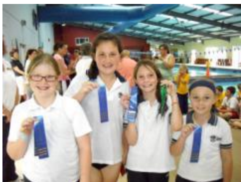
Our winning P6 Relay Team!