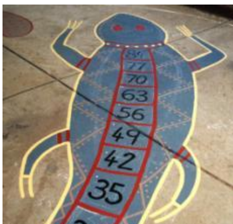
A fun way to learn the 7 times tables