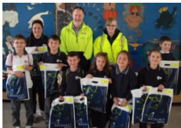
Book Link Award recipients, 2012

The Bathurst Regional Library Van runs a Book Link Program whereby the students are rewarded for borrowing library books from the van, reading them, recording the books read and returning them promptly to the van. Reading medallions are awarded to the students and they are also presented with free library bags filled with various rewards such as stationary and reading material.