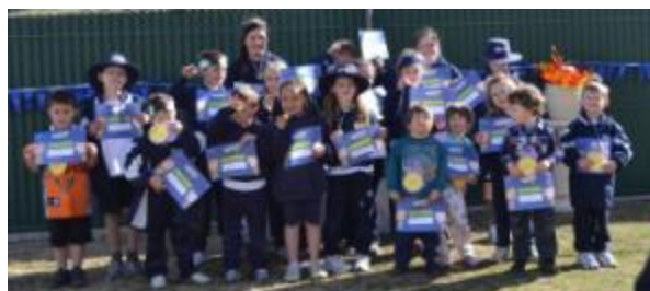
Students with their Premier's Sporting Challenge certificates on the Mini-Olympics Education Week Open Day