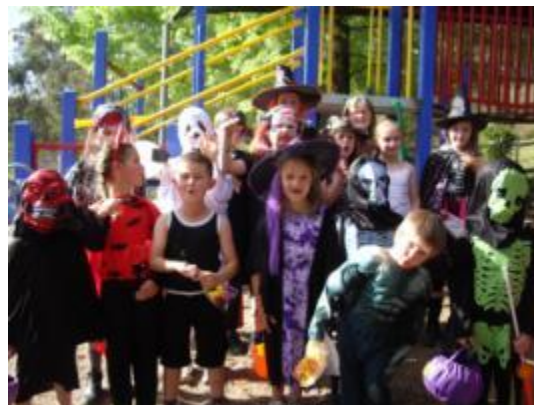
Trick or Treat?