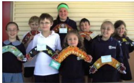
Winners and Place-getters in the Australian Novelty Section of the Trunkey Wool Festival