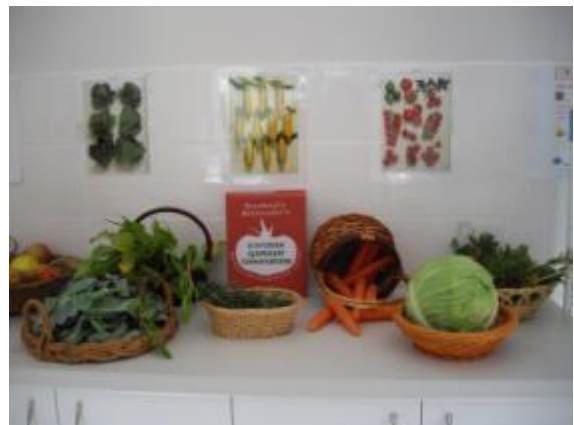
The Harvest Table

The majority of the existing school canteen was demolished at the start of Term 3 and work commenced immediately on the kitchen renovation. Three colour-coordinated student workstations were designed and a harvest table was constructed. New kitchen appliances and utensils were purchased and many donations were gratefully accepted from local businesses.