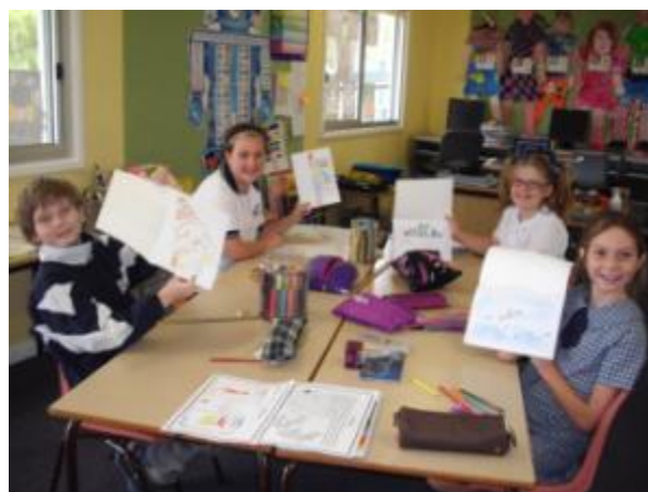
Stage 3 students take care to present their bookwork neatly