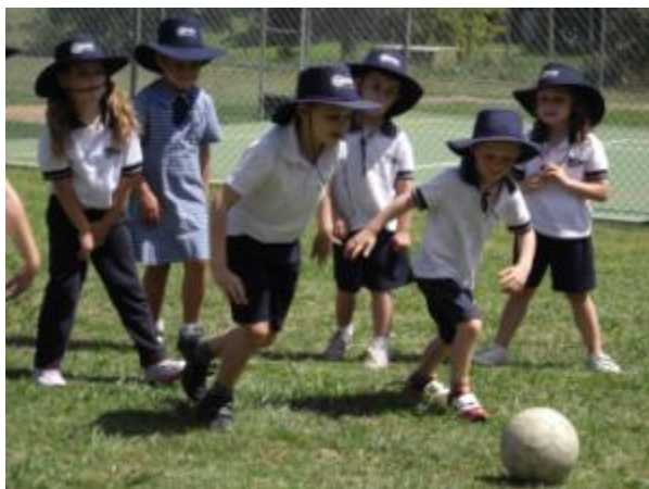
Students playing soccer on Sports Day