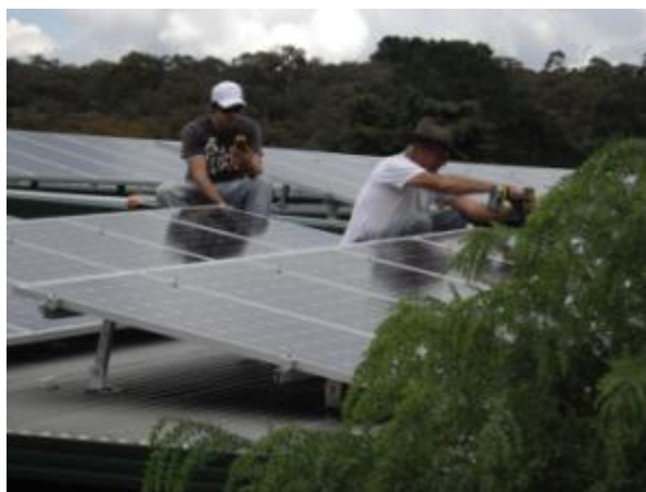
Installation of our 10kw solar system on the roof of the Library and Cola