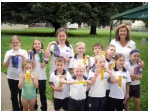
The Trunkey P6 Relay Team won their event which was an outstanding achievement!