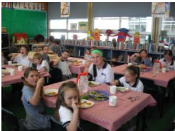
Deliciously healthy food we have cooked ourselves!