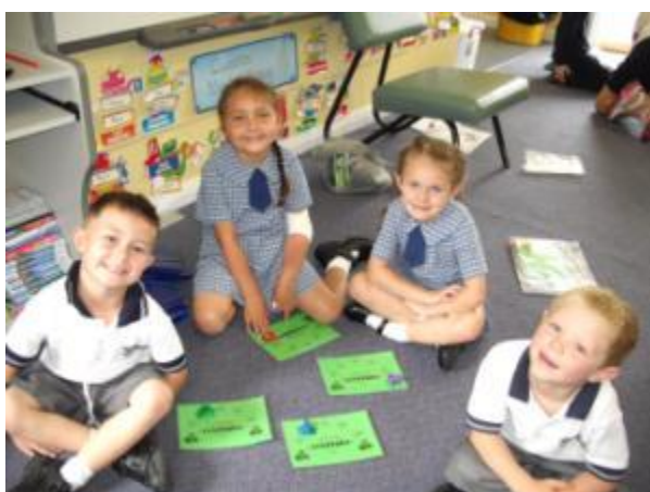
Kindergarten Maths games