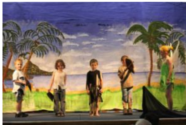
The Little Lost Boys from Peter Pan

The school planning policy provides direction for the preparation and implementation of school plans including the identification of priority areas, intended outcomes and targets that are consistent with the NSW State Plan and the Department's planning documents.