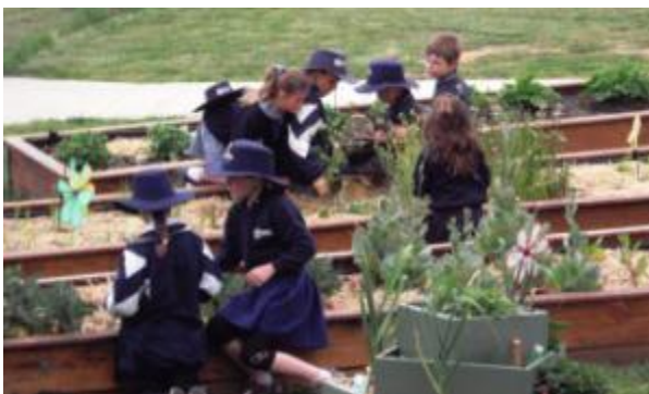
Students working in the garden

Term 1, 2012 saw the construction of seven raised garden beds with the assistance of the Bathurst Correctional Centre's Outreach Team. Four garden arches were erected over a pebble pathway leading from the main classroom through the garden towards the Office. A working bee was held to fill the beds with soil and organic matter; all students, many parents and staff members assisted.