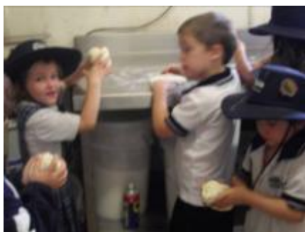
Pre-Kinders enjoy making bread at the Blayney Bakery

Our school leaders attended the Young Leaders Day at the Entertainment Centre in Sydney and the Impact Leadership Day at Bathurst. Both experiences are aimed at demonstrating to students how to have a positive influence on others within their leadership positions.