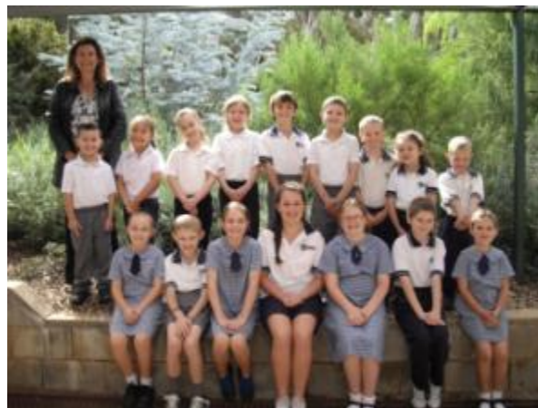
The Class of 2012

Our end of year enrolment for 2012 was 13. Of this total there were 8 females and 5 males, 6 students in the Primary and 7 students in the Infants.