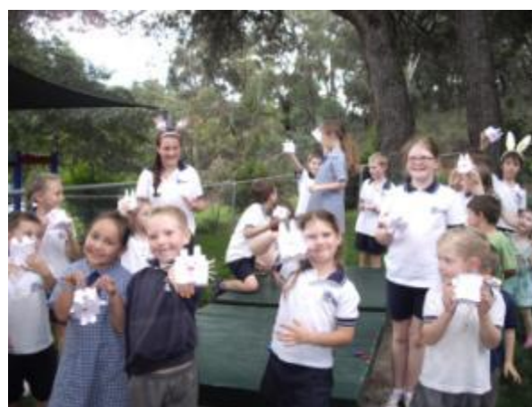
2012 Easter Egg Hunt