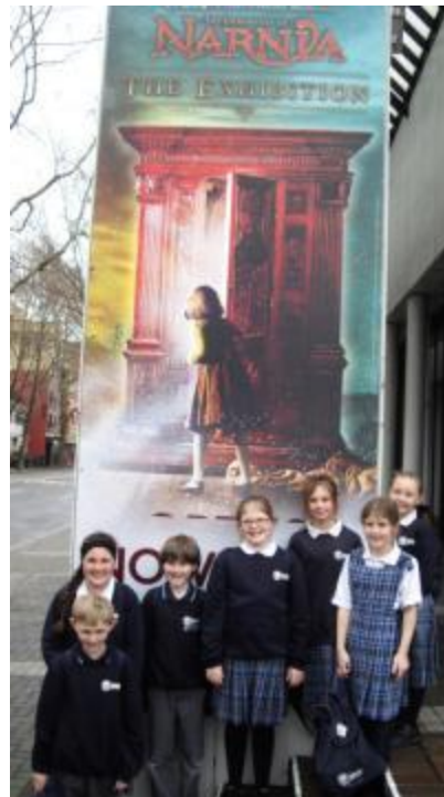
Narnia excursion in Sydney

Our school leaders attended the Young Leaders Day at the Entertainment Centre in Sydney and the Impact Leadership Day at Bathurst. Both experiences are aimed at demonstrating to students how to have a positive influence on others within their leadership positions.