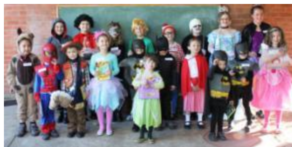
Book Week characters in their delightful costumes