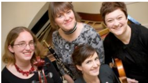
'Jacana' performed at Trunkay Creek for the students from the Heritage Country Small Schools