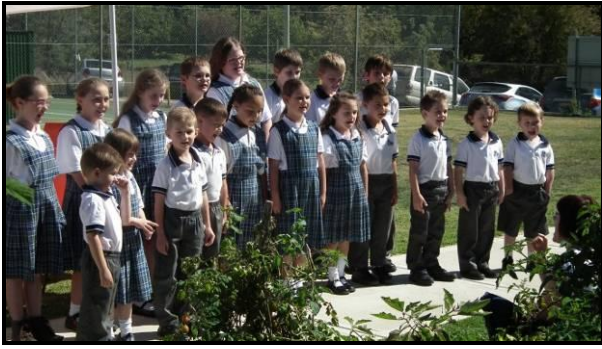
Our students entertained guests with the perfect song 'The Garden Song'

A morning tea was provided which consisted of delicious dishes the students had created through the SAKGP. All children were wonderful hosts as they served guests finger food in our beautiful garden environment.