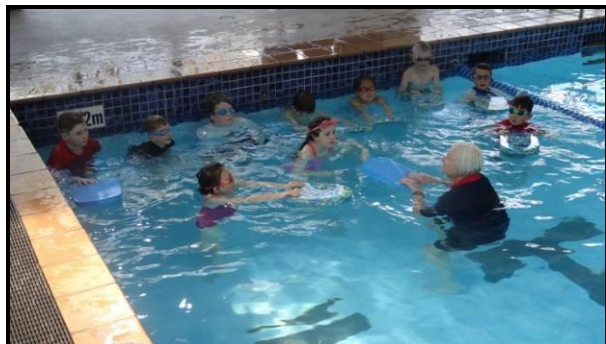
Students participating in the School Swimming and Water Safety Scheme

year to benefit the students at the school. It involves a 10 day intensive swimming program with Auswim qualified instructors at Centrepont Sport and Leisure Centre in Blayney. Transport is provided for the students to access the program during school hours and the cost is offset by a school grant.