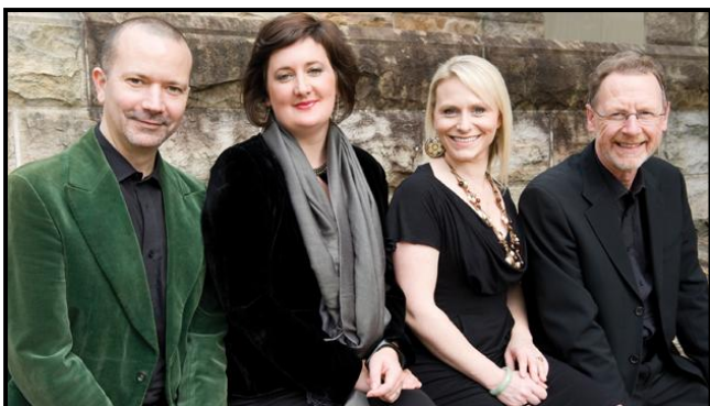
'The Song Company'