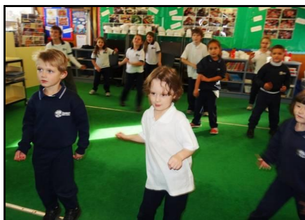
Zumba is a lot of fun!