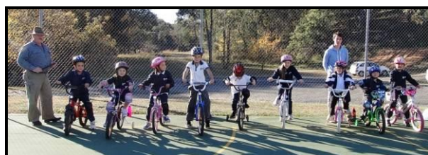
Bike Riding during Active-After-School Sport