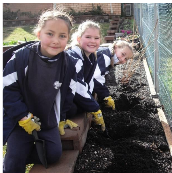
Planting raspberry canes

Garden lessons commenced in Term 2, 2012. A greenhouse was purchased and a flower bed was established.