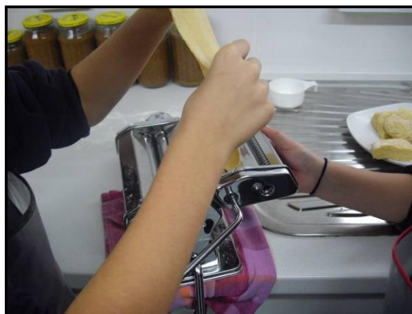
Feeding the dough through the pasta machine