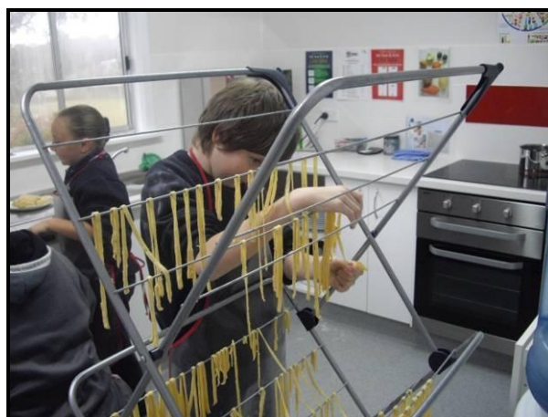
Hanging the pasta on a drying rack