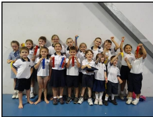
A multitude of swimming ribbons