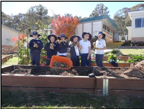
The potato bed