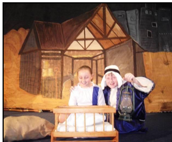
'Mary' and 'Joseph' in 'The Nativity' School Play

A full copy of the school's 2013 financial statement can be obtained by contacting the school.