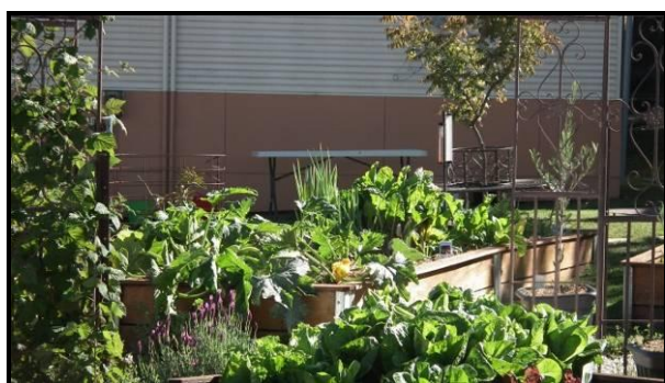
Our beautiful vegetable garden

Trunkley Public School prides itself on delivering outstanding educational programs including Reading to Learn, Jolly Phonics and Jolly Grammar, Athletics and the Stephanie Alexander Kitchen Garden Program.