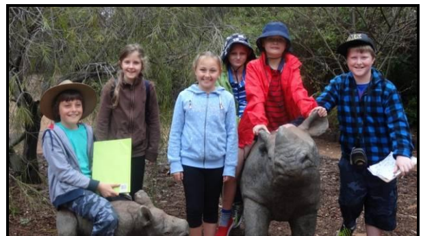
Stage 2 students enjoying Dubbo Zoo