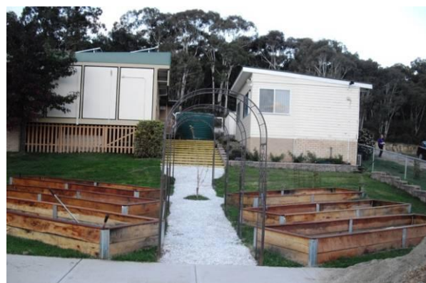
The garden under construction

Term 1, 2012 saw the construction of seven raised garden beds, two herb planters and four garden arches stretching over a pebbled pathway. A working bee was held to fill the beds with soil and organic matter; all students, many parents and staff assisted.