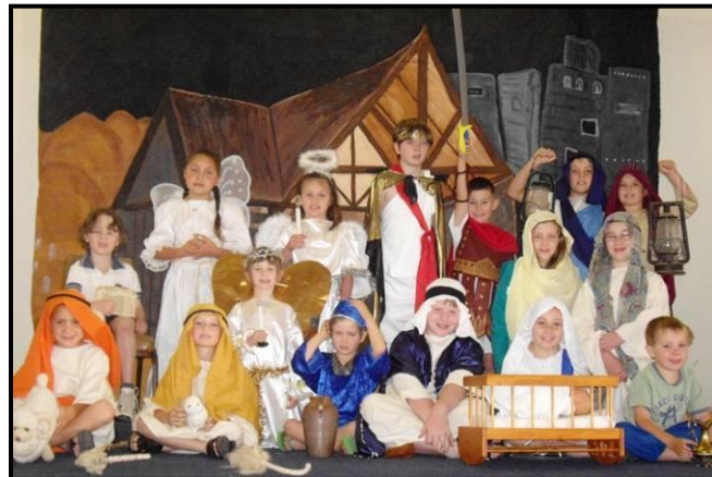
The cast of 'The Nativity'