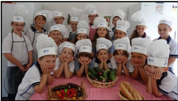
Our students wearing their chef's hats in preparation for the launch

2013 saw the Official Launch of the Stephanie Alexander Kitchen Garden Program at our school in April. This was made possible through a hugely dedicated staff and community ensuring the program was fully implemented and successful in meeting the milestones set.