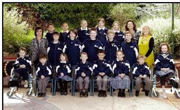
The Class of 2013

Trunkey Public Schools' enrolment for 2013 was 20. Of this total there were 8 girls and 12 boys. There were 9 Primary and 11 Infants students.