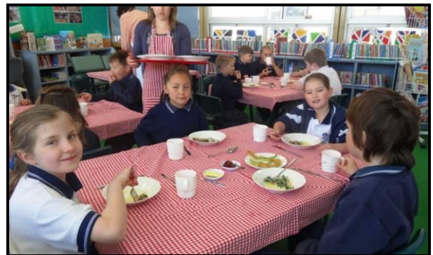
Students enjoy sampling the dishes