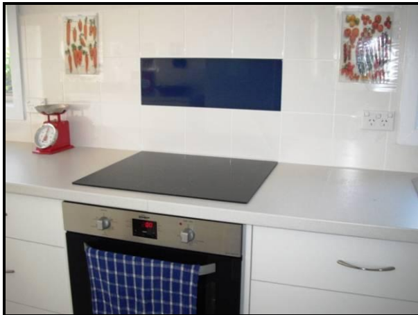
The Blueberry Workstation

The existing School Canteen was demolished at the start of Term 3 and work commenced immediately on the kitchen renovation. Three colour-coordinated student workstations were designed and a harvest table constructed. New kitchen appliances and utensils were purchased and many donations were gratefully accepted from local businesses.