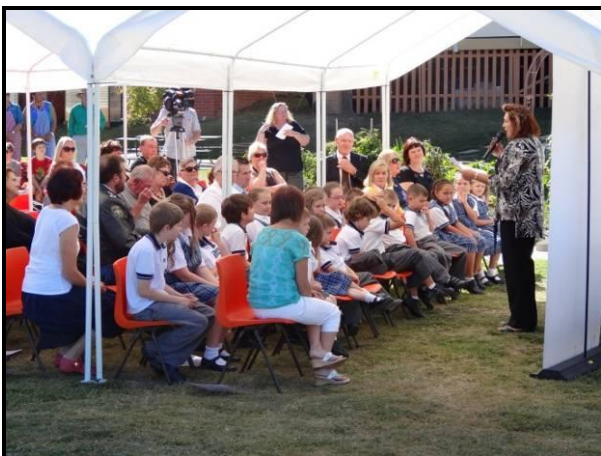
Guests gathered under two large gazebos for the Official SAKGP Launch