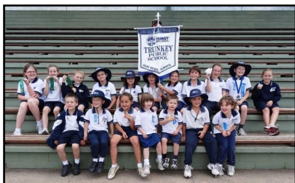
TPS students displaying their ribbons at the conclusion of the Athletics Carnival