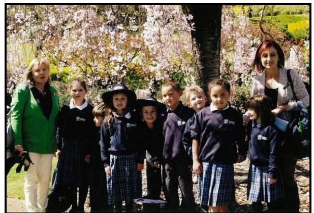
Infants students enjoying the Japanese Gardens, Cowra

Stage 2 students attended a three-day excursion to Dubbo where they stayed at Wambangalang Field Studies Centre, studying Environmental and Aboriginal Education. They also visited the Old Dubbo Gaol and Taronga Dubbo Zoo, as part of their studies in HSIE and Science.