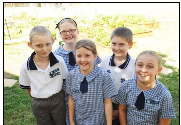
Our Student Leadership Team, 2013