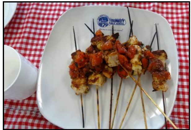
Tasty dishes created by the students using ingredients sourced from our very own garden

The students set the tables in the dining room and meet for morning tea to sample one another's delicious dishes.