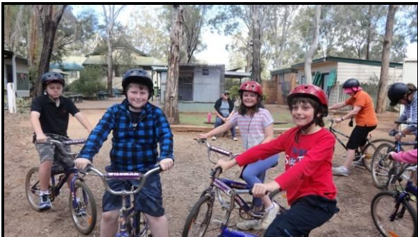
Students enjoying the Bike Ride at Wambangalang FSC

Stage 3 students attended a five-day excursion to Canberra where they visited The War Memorial, numerous embassies, the National Museum, Parliament House and the Snowy Mountain Scheme.