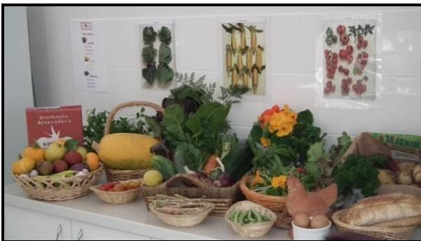
The Harvest Table

Some of the dishes created in 2013 during cooking lessons include: