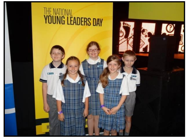
Student Leaders at the Young Leaders' Day

Our student leaders attended the Young Leaders Day at the Sydney Entertainment Centre and the Impact leadership Day in Bathurst. Both experiences demonstrate to the students how to have a positive influence on others within their leadership positions.