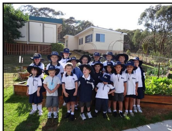
Our K-6 Class