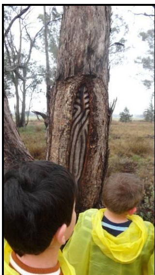
Looking at a scar tree; the scar remaining from a bark canoe being cut from the tree

A highlight in 2013 was the Stage 2 excursion to Wambangalang Field Studies Centre, where the students studied Aboriginal artefacts, traditional weapons and learnt about their culture using a hands-on approach.