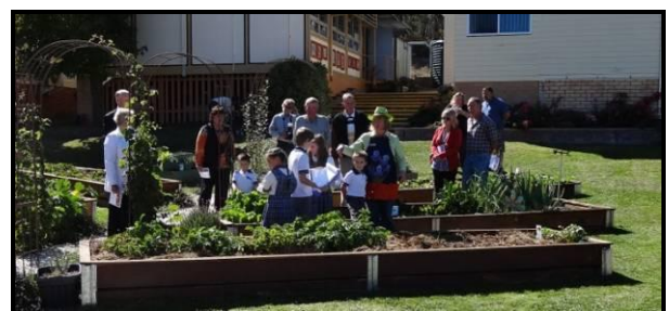
A Garden Workshop was held with the students explaining their autumn crop