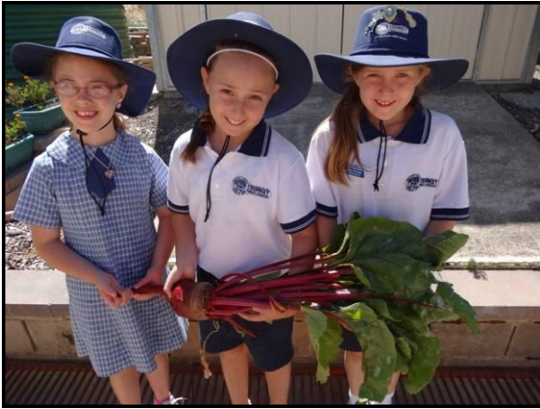
Our first beetroot of the season