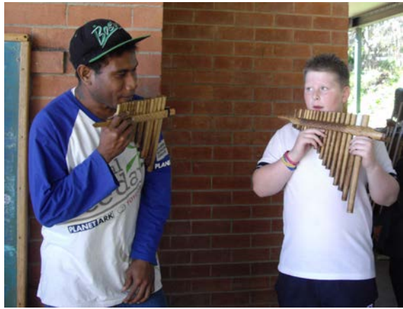
Learning how to play the pan pipes