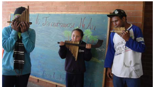
Getting a few tips on how to play