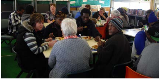
Enjoying lunch with friends