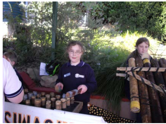
Loving the magical sound of the pan pipes