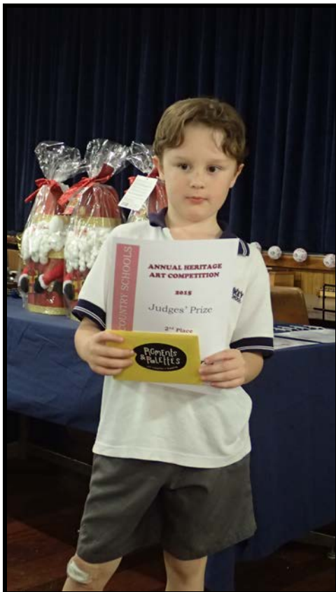
Brigham - HCS Art Show Prize