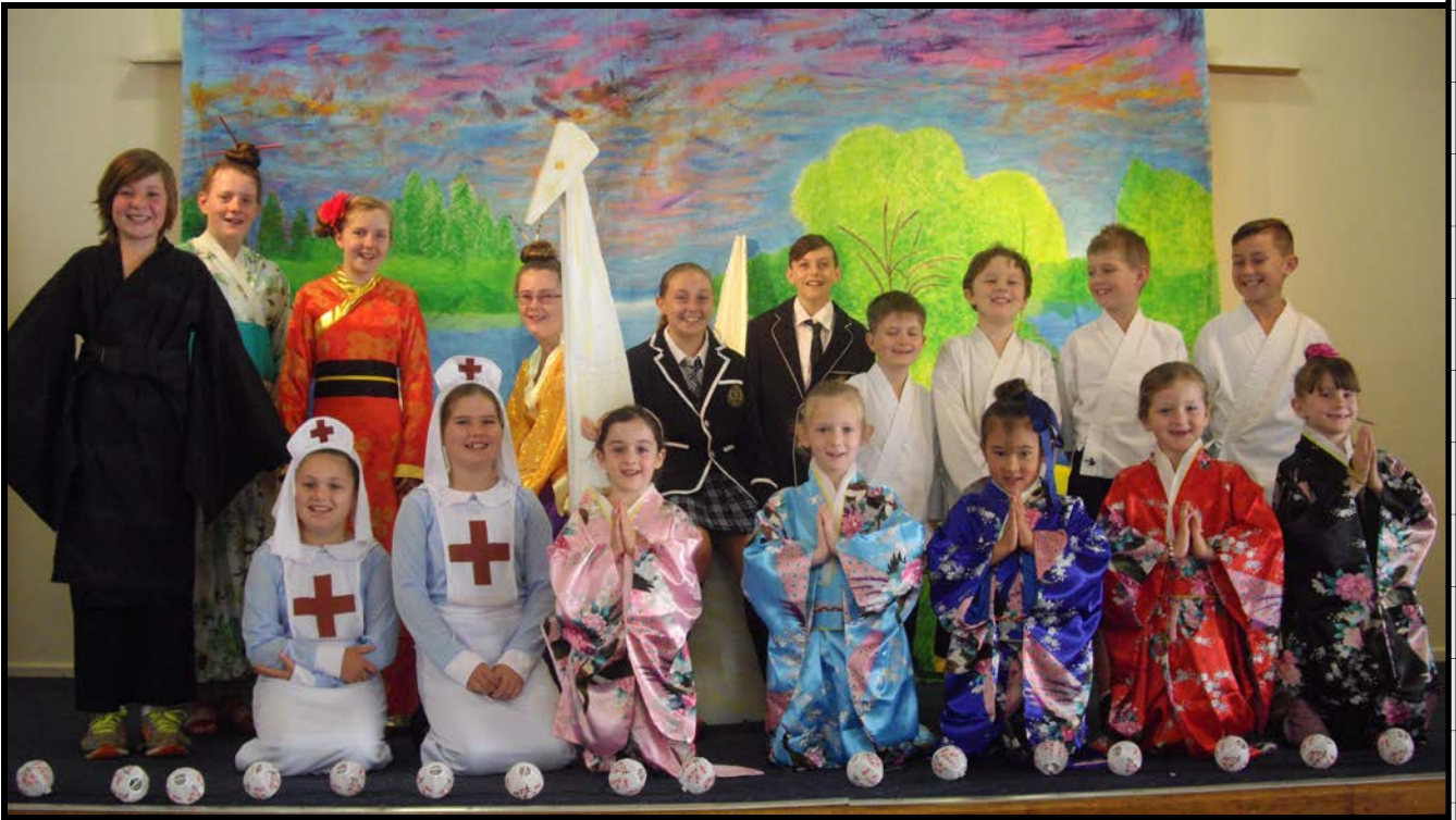
The wonderful cast