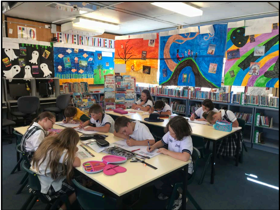
Working hard on the Life Education focus