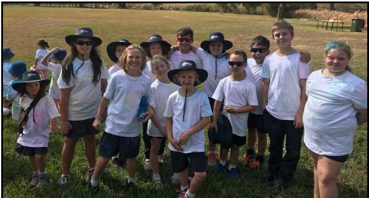
Fun at the Colour Fun Run

The day was a wonderful success and the Heritage Country Small Schools' funds raised will be calculated shortly. Many thanks to everyone for their enthusiasm and involvement.