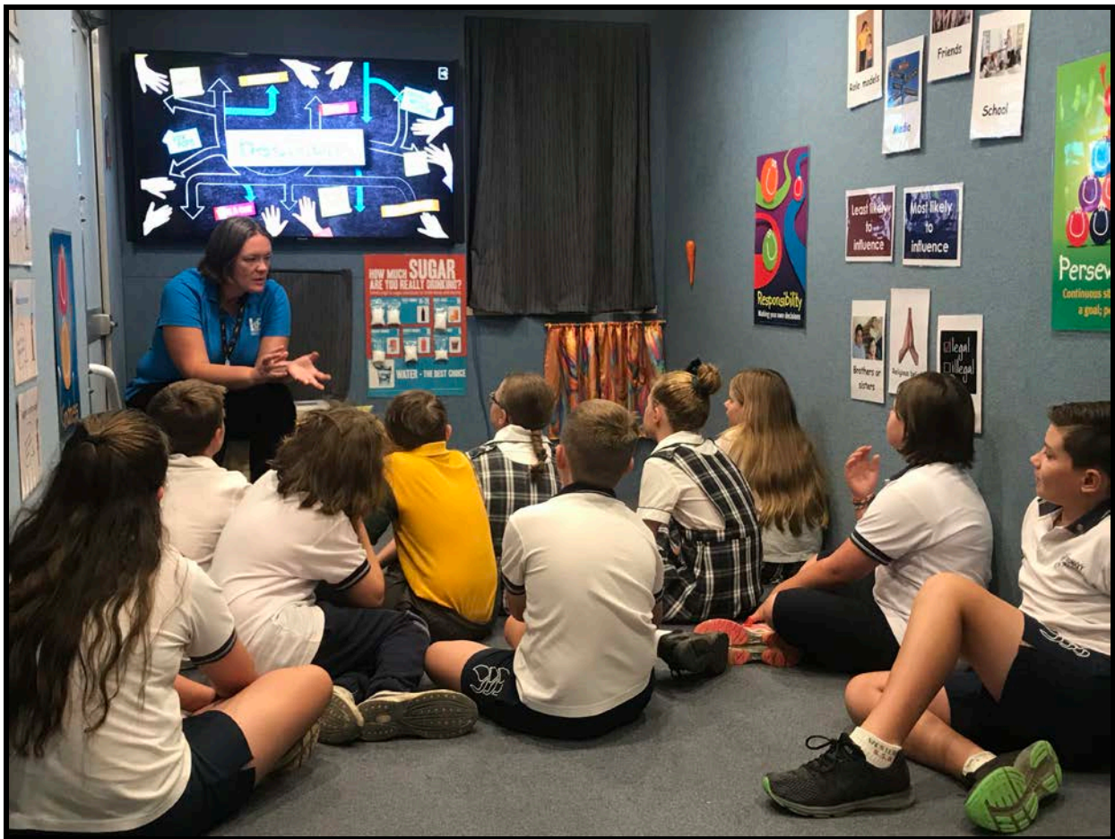
Stage 3 students inside the van

A great day was had by all students who attended the Life Education Van on Wednesday, 11 th April.